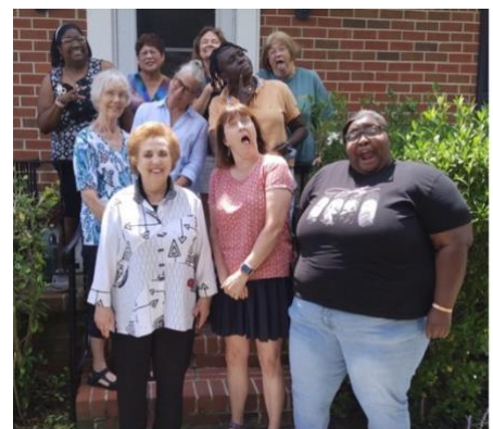
And here is YOUR Board After the meeting! (it was l-on-g!) (Not pictured but at the meeting: Barbara Woodlee)