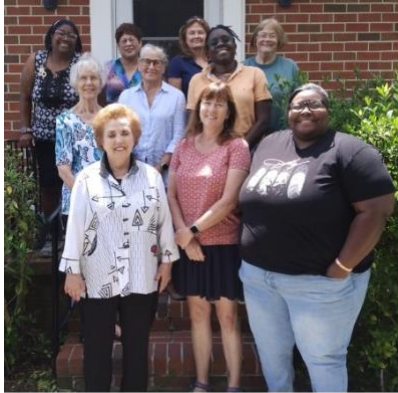
Here is your board before the meeting

Your Board met for its annual Planning meeting on August 9, 2025. Our first order of business was to review the results of the membership survey (although participation in this was low). A meeting time for the Branch resulted in much discussion. As many of you know, we used to meet on Wednesday nights...but some of our members said that they didn't want to drive at night. So, we switched our meetings to Saturday afternoons, hoping that our attendance would rebound. It did