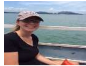
Ferry to Taboga Island

Back at the August board meeting, I shared a special announcement. I took a leave of absence from my job managing public relations for Girl Scouts of the Colonial Coast in Chesapeake and took a position with Girl Scouts of the USA to lead a three-month pilot project to build the Girl Scout program in Panama from the ground up. Although Girl Scouting was quite popular here during the days of the Canal Zone, membership numbers dropped over the years. By the time I arrived, there were zero Girl Scouts registered in Panama. My job, along with one colleague, is to get the program started again for American girls living here.