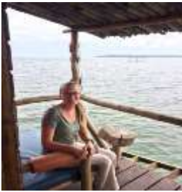
Bocas del Tora