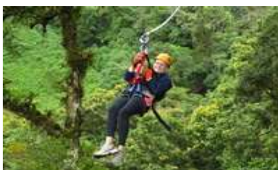
Zip lining in Boquete

I've also made the most of my free time to explore Panama. I've cruised down the Panama Canal on a boat to visit Monkey Island, visited an island in the Pacific and hiked up Ancon Hill, the highest point in Panama City. On my most recent adventure, during the holidays here in Panama, I flew to the western part of the country and spent a few days in the mountains of Boquete, followed by two days in the Caribbean in the Bocas del Toro archipelago. Zip lining, horseback riding and snorkeling were all part of the fun.